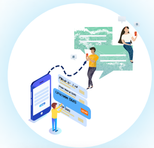
Bulk SMS Service