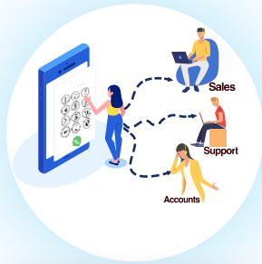
Cloud Telephony (IVR)