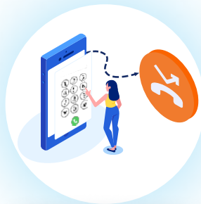
Missed Call Service