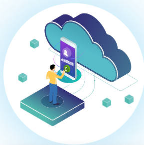
Cloud Based Telecalling