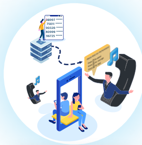
Voice SMS (OBD)