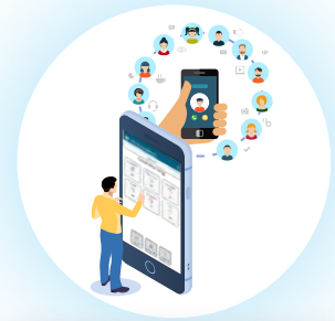
Android Based Telecalling