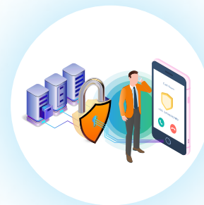
2FA OTP Service